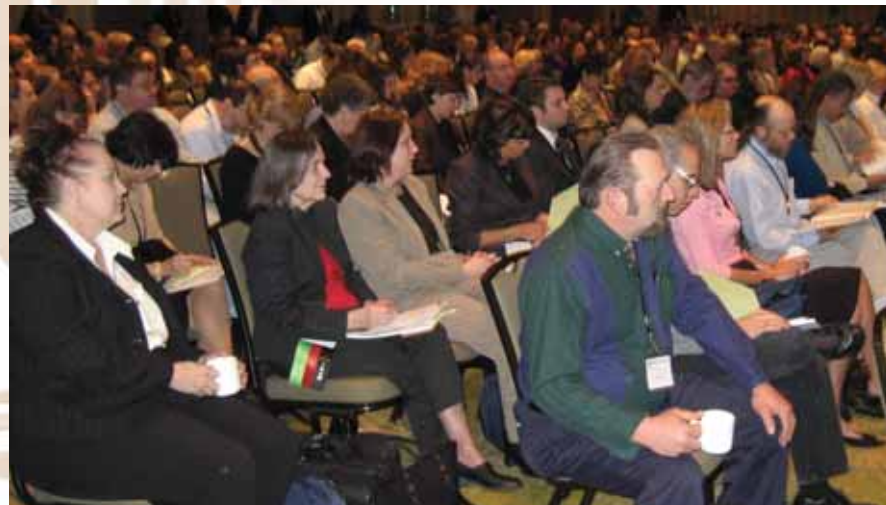
2007 Annual Conference Opening Ceremony, Tucson, AZ.