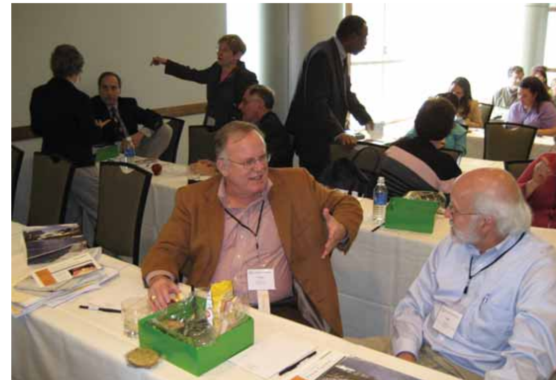
2007 NLADA training event attendees.

The Substantive Law Conference, July 18-21, San Jose, CA, is the nation's most comprehensive training for attorneys working with low-income communities. The conference continued the redesigned format of the 2006 event, targeting practitioners with five or fewer years of experience, those who are changing specialties and those seeking a refresher on the fundamentals. The updated session format continued to prove popular for the more than 300 participants and faculty. Sessions across the board were very well received. One of the highlights was a series of sessions on race equity that included a number of prestigious presenters from outside the legal aid community.