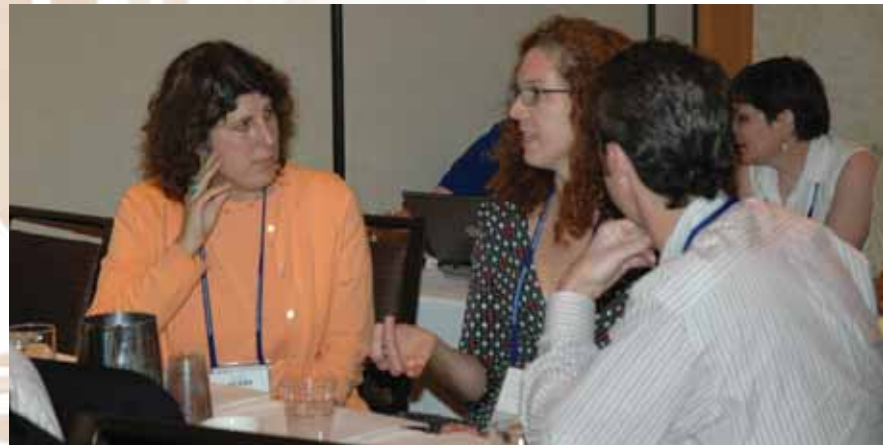
2007 NLADA training event attendees.

Appellate Defender Training is the only appellate defender conference in the nation where participants work on actual cases.