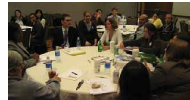
NLADA training event attendees in roundtable discussions.