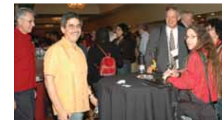
NLADA members and staff enjoy social activities at the 2007 Annual Conference in Tucson, AZ.

Participants completed the online Leadership Practices Inventory (LPI) prior to attending the conference. The LPI measures the frequency in which individuals engage in five leadership behaviors: Model the Way, Inspire a Shared Vision, Challenge the Process, Enable Others to Act and Encourage the Heart. This 360-degree feedback instrument allowed participants to receive feedback from their managers, direct reports, co-workers, community partners and other colleagues in the form of a feedback report. Participants learned about the behaviors and instrument. They also went through a series of interactive exercises to understand the differences between their self assessment and the feedback from others. Each participant developed an individual leadership development action plan, and participants continued their learning through a year-long process that included revisiting the LPI every six months.